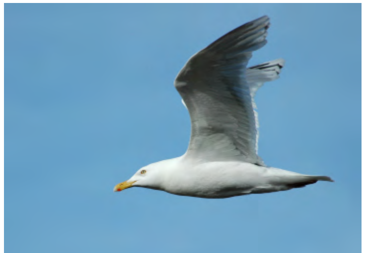
Top and middle: Adult Glaucous-winged Gull at Pauline Cove, Herschel Island, Yukon. 22 July 2005.