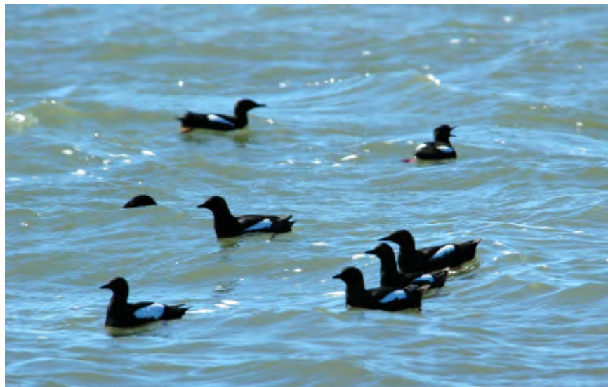
Adult Black Guillemots on the nearshore waters at Pauline Cove, Herschel Island. 25 July 2005.

Movement of Black Guillemots between Herschel Island and Point Barrow has been documented. An adult caught in 1984 at Barrow bred in 1986 on Herschel (Divoky 1998). This may well be the longest distance recorded for an alcid between prospecting and breeding (Divoky 1998).