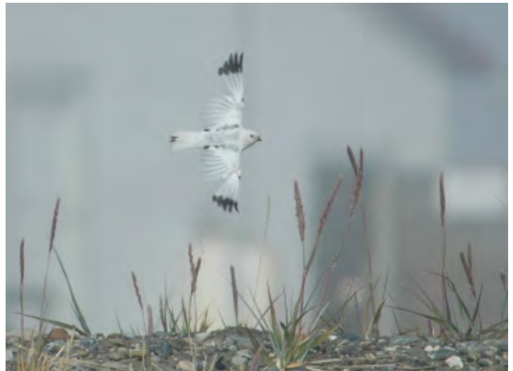
McKay's Bunting at Herschel Island, Yukon on 22 July and 24 July 2005. Note its extensively white plumage, including a white back, and white tail with black tips on just the central tail feathers.

The McKay's Bunting at Herschel Island provided the first record for the Yukon Territory (Eckert et al. 2005, Sinclair et al. 2003), and perhaps the first for the Beaufort Sea region (Johnson and Herter 1989). It further enshrines Herschel Island as northern Yukon's premier birding hotspot, having hosted numerous outstanding rarities such as Wood Sandpiper, Ross's Gull, and Yellow-headed Blackbird (Sinclair et al. 2003).