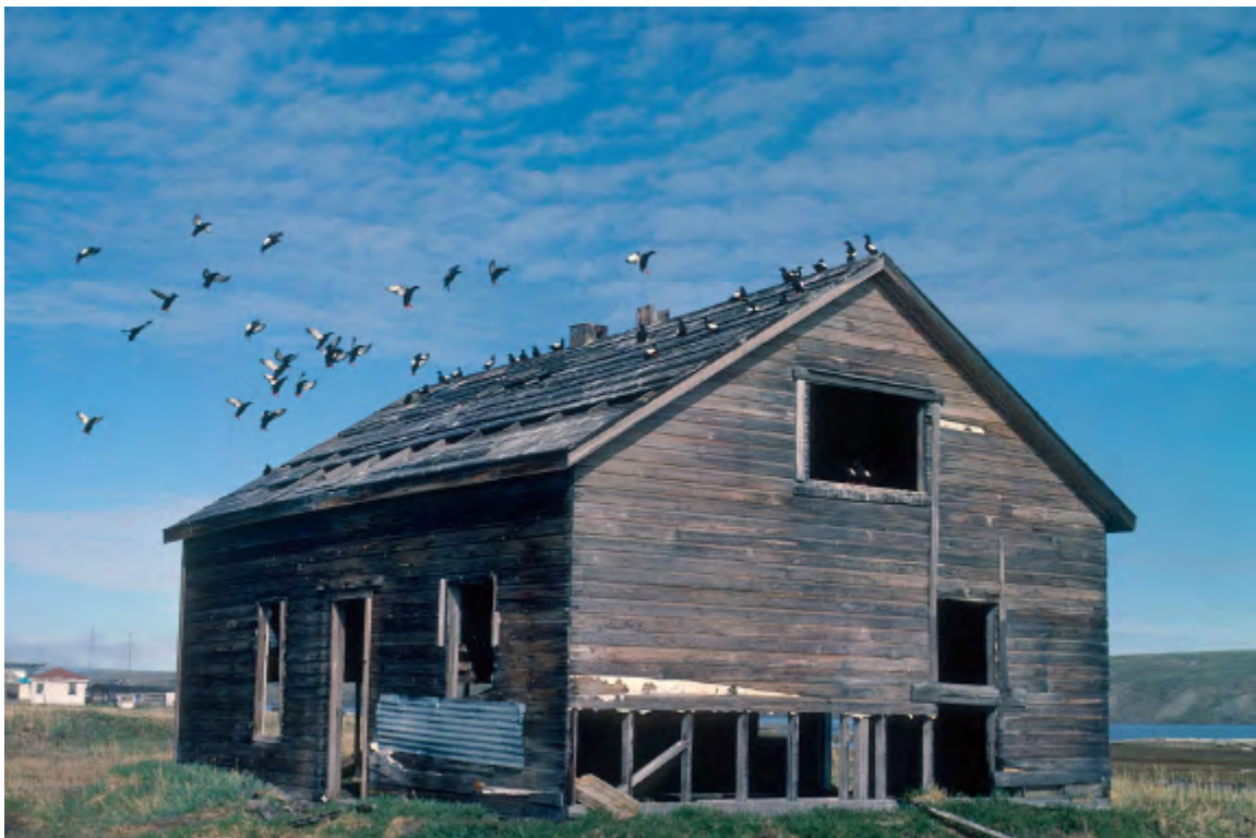
This photo taken 3 July 1984 shows 48 Black Guillemots flying and landing on the historic Anglican mission house at Pauline Cove. This was prior to the installation of the nest boxes and shingle paper on the roof.