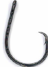
Barbed circle hook

In our experience, circle hooks are ideal for setlines. The best rig we have tested is a 2/0 barbless circle hook on a 40lb test monofilament leader, tied using a knot such as a perfection loop or rapala knot, which allows the hook to rotate freely when hooking a fish. This rig has high catch rates, consistently catches burbot in the corner of the mouth, and is easy to unhook once you've landed the fish.