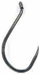
Barbless J hook

Circle hooks differ from conventional J-style hooks in that the hook point is bent back toward the hook shank. This design means that as a fish swims away with the bait in its mouth, the hook doesn't set until it reaches the corner of their mouth, hooking them there rather than in the throat or stomach. The curved-in point also makes it harder for fish to spit the hook, even with barbless circle hooks.