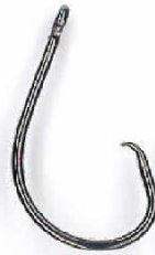
Barbless circle hook